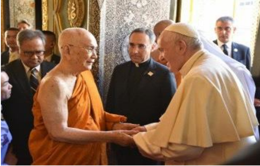
Photo: Pope Francis meets with Somdet Phra Ariyavongsagatayana, Supreme Patriarch of Thailand, at Wat Ratchabophit Sathitmahasimaram (Source: Ministry of Foreign Affairs of Thailand website: https://mfa.go.th )