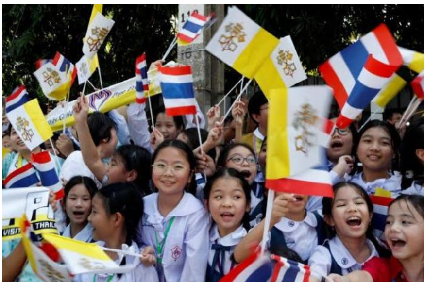
Photo: Thai Catholics gather to welcome the arrival of Pope Francis in Bangkok, November 2019

Almost four decades later, the meeting between the present King and Queen and Pope Francis echoes not only the close bond of friendship cultivated over centuries between Thailand and the Vatican, but also speaks volumes about the monarch's pivotal role as a unifying force and an upholder of all religions in the promotion of interfaith harmony and peaceful coexistence in Thai society.