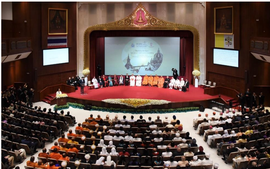
Photo: Pope Francis meets with priests and representatives of different religions at Chulalongkorn University Auditorium

Thailand would not be where it is today if the monarchy did not serve as a pillar of strength and a guiding light, leading by example and wielding incomparable moral authority. The generosity, thoughtfulness and embracing of diversity extended from the sovereign have shaped the nation and countless lives. Following their monarchs, Thais have adopted a mentality of openness and mindfulness of the differences among faiths and religions, and most importantly, a profound respect for those differences. The actions of the monarchy have indeed forged connections, furthered interreligious understanding and demonstrated that, regardless of what faith we hold, we are bound together by goodwill and shared values of kindness and respect.