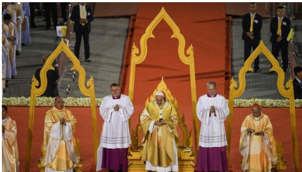
Photo: Pope Francis celebrating his first public mass at the National Stadium in Bangkok in November 2019 (Source: Vatican News website)